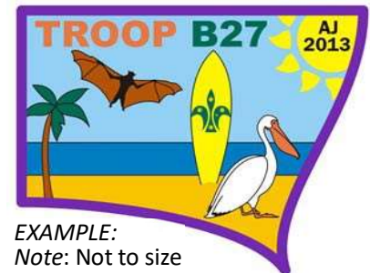
EXAMPLE: Note: Not to size

The final AJ2025 NSW Contingent badge will measure 95mm x 75mm